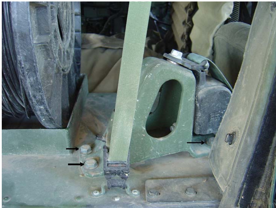
Figure 3 Right Rear Fender with Seat Belt Bracket