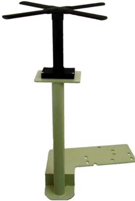
Figure 4 RMT-25 with X-Wing Antenna Attached