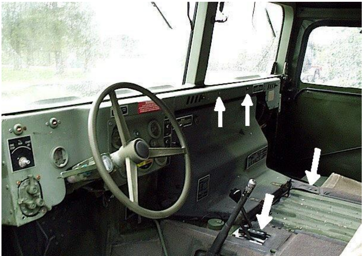
Figure 1 MIK-14 Rack Mounting Position in HMMWV