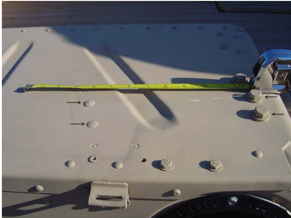
Figure 2 Right Rear Fender without Seat Belt Bracket